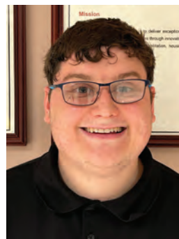
Logan Reed Dining Facility, Fort Indiantown Gap, PA