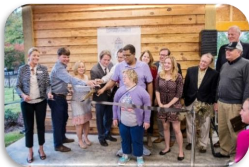
A successful $1.3 million Capital Campaign relied on community collaboration to raise funds to build Friendship House.

The ServiceSource Foundation also successfully implemented a $1.3 million Capital Campaign to create Friendship House Fayetteville. The Friendship House Capital Campaign raised $1 million in donations and pledge commitments along with $300,000 of in-kind support to build three, two level homes and a community pavilion. The homes provide intentional, community-based living for young adults with disabilities who live, as roommates, with medical profession college students and young professionals.