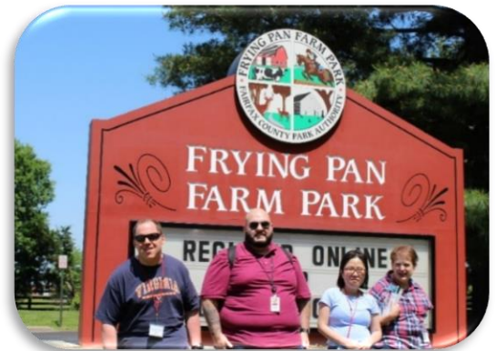
ServiceSource LTCIS participants and staff enjoying a community outing to Frying Pan Farm Park

ServiceSource is eager to create a community coalition through the launch of the Community Integration Center at Ellmore Farmhouse. Visitors of Frying Pan Farm Park and the community at large will benefit from touring the home, enjoying light bites from the café, and the opportunity to interact with their fellow community members with disabilities. At the same time, this program will provide individuals with disabilities with person-centered, meaningful opportunities to skill build and engage in their community while learning about and honoring the historical significance of Ellmore Farmhouse. Together we can Do More at Ellmore Farmhouse to support an inclusive Frying Pan Farm Park community where all its members can grow and thrive!