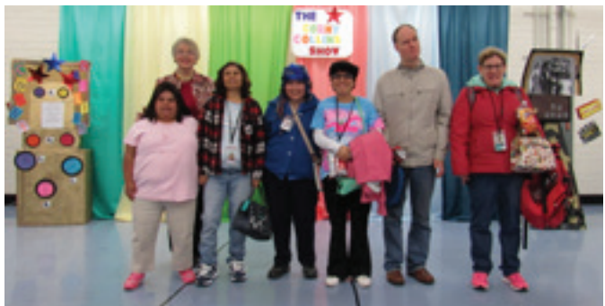
The musical production of Hairspray was celebrated at the Woodmont Community Integration Center in 2017. Music and dance programs are fully funded by the Foundation.