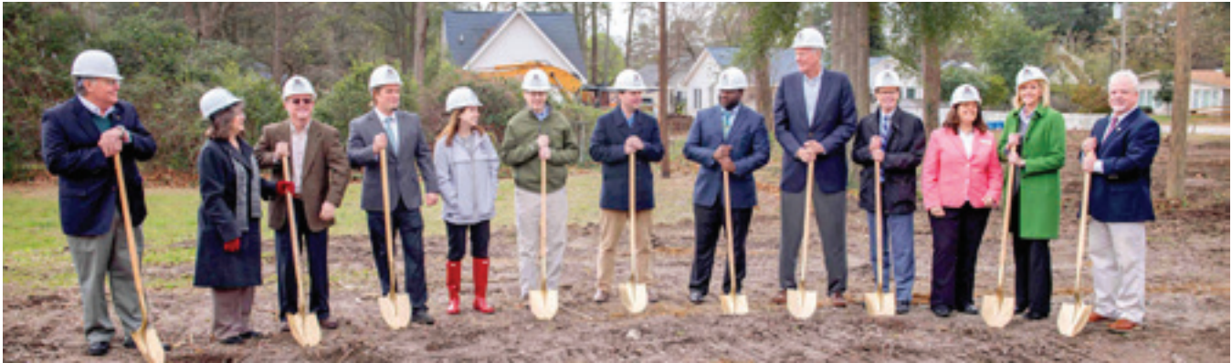
Community stakeholders and donors break ground on Friendship House in Fayetteville, NC.