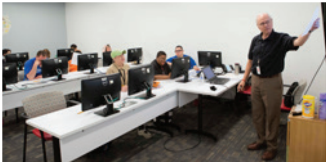
The Volunteer Services Program leverages volunteers from the community who offer a variety of inclusive and innovative programs, such as leading book clubs, finance and budgeting courses, and sewing and crafts.

The ServiceSource Foundation also partially funds Autism Spectrum Services, Senior Services, Pathways to Careers, the North Carolina Warrior Bridge Program and expressive therapies such as music, art, dance, yoga and therapeutic horseback riding in our Long-Term Community Integration Services. Your support of the ServiceSource Foundation allows us to gap fund these programs for expansion and sustainability.