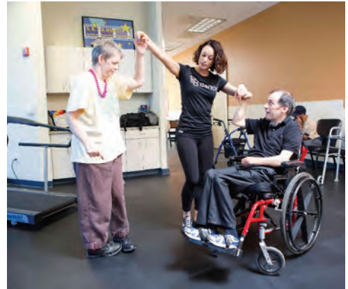
Individuals at our Chantilly Community Integration Center participate in music, art, dance and yoga therapy programs, funded by your generous support!