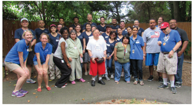
Volunteers from Playa Hotels and Resorts spent a day landscaping, painting and staining at Annandale House as part of the Volunteer Services Program.

The Foundation provided gap funding for ServiceSource's Autism Spectrum Services program and the adult Senior Services program. ServiceSource operates fourteen senior centers in Fairfax County, serving hundreds of senior citizens daily and integrating seniors who have disabilities.