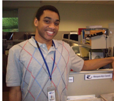
Autism Spectrum Services were initially funded by the Foundation in our Delaware office. Gap funding continues as the program expands into Virginia.