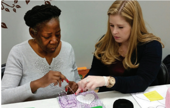
ServiceSource provides support at 14 Senior Centers in Fairfax County, VA.